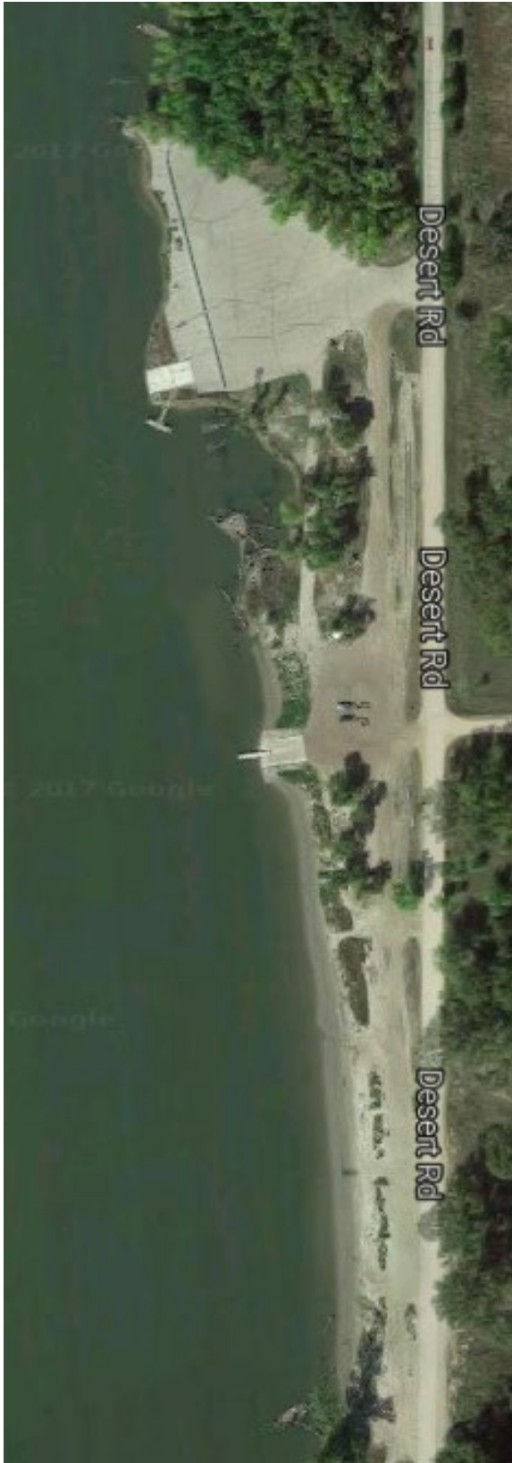
Kimball Bottoms – 11300 Desert Rd